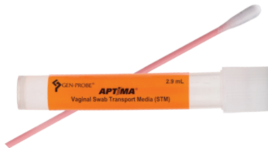
2 Aptima vaginal PCR swab for Chlamydia and Gonorrhoea; Trichomonas