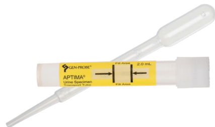
3 Aptima PCR Urine kit for Chlamydia and Gonorrhoea