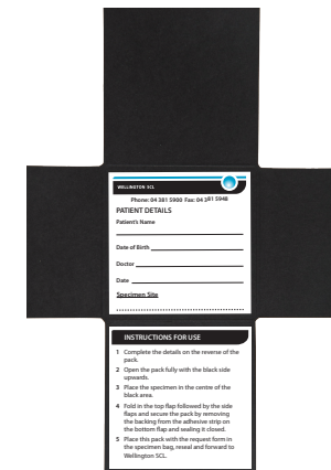
5 Mycology pack (for example nail clippings, skin scrapings, hair etc)