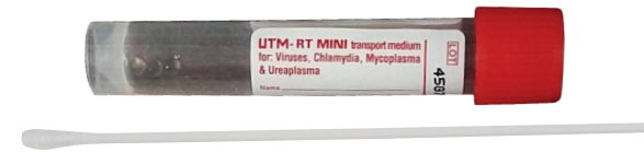
4 Universal transport media (UTM) for Herpes Simplex/Herpes Zoster, Influenza, Bordetella Pertussis and Measles PCR (Not to be used for Chlamydia Testing)