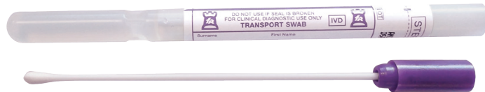
1 Amies swab for bacterial culture